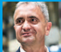
Uwe Lauber , CEO, MAN Energy Solutions SE

leading grid technology companies and with our HVDC systems, we're bringing offshore wind power to consumers and connecting countries and entire continents. Our electrolyzer portfolio is taking storage — a crucial building block in the energy transition — to the next level. By pioneering the production of green hydrogen, we're enabling the decarbonization of entire sectors, including buildings (heating and cooling), transportation and industry.